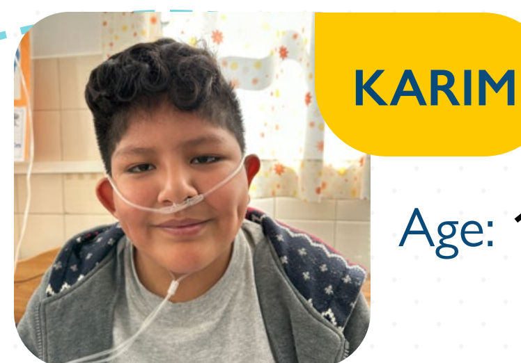
Age: 10 Years