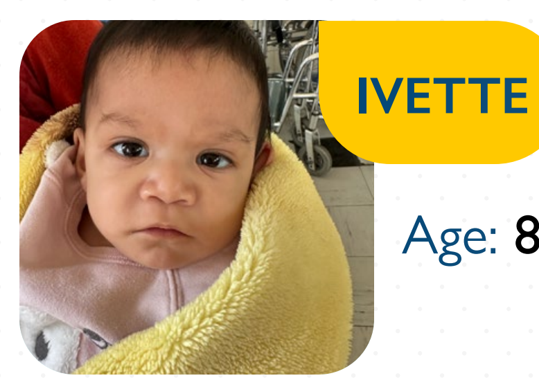
Age: 8 Months