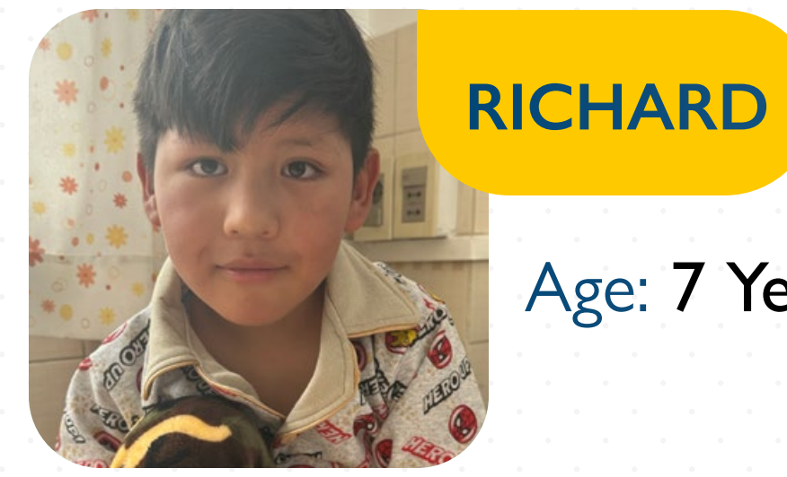
Age: 7 Years