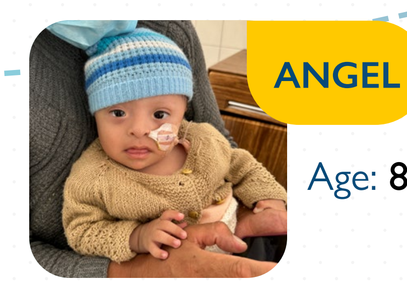
Age: 8 Months